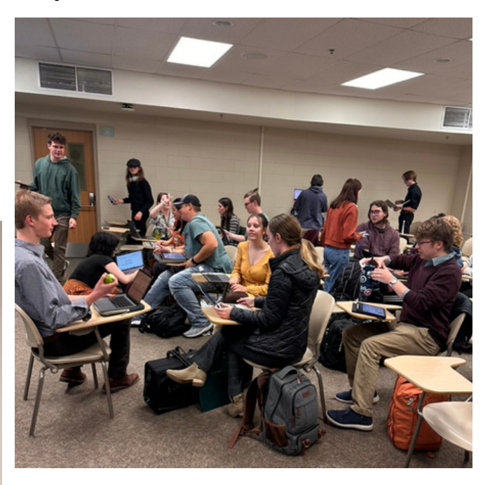
Teaching artists deliberate on how to implement dispositions of democracy into teaching practice.