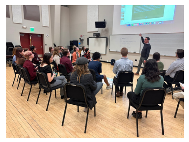
MSOE Senior Admin, Undergradmin, Teaching Artists, and ToTs all come together to prepare the first night with students.

I would also like to welcome the High School students into the Trying-on-Teaching program! With the impacts of the pandemic still being felt in arts enrollment across all educational institutions, we are excited to see that the future is bright with individuals showing a strong interest in becoming K-12 teachers.