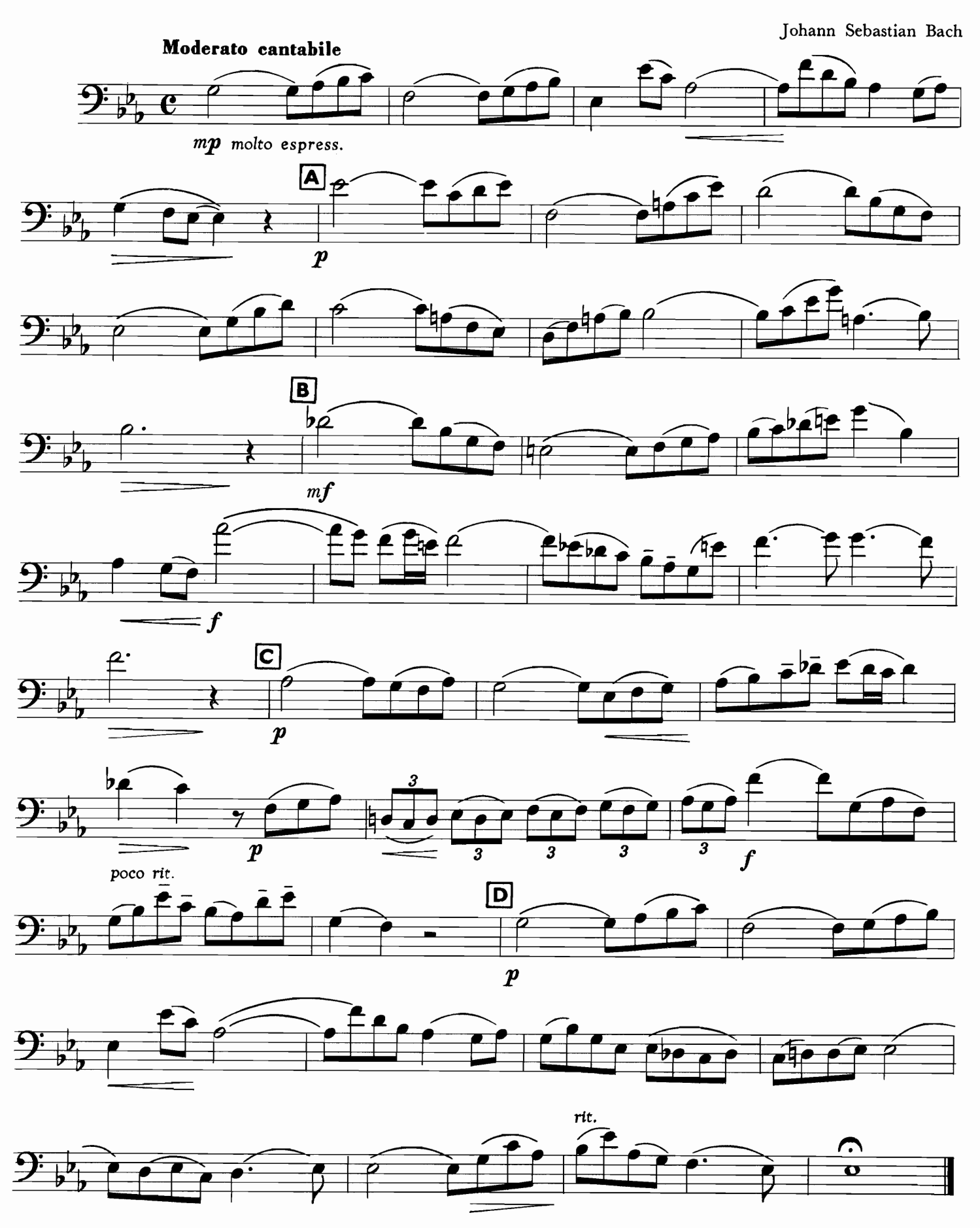
from: Piano Concerto in F Minor